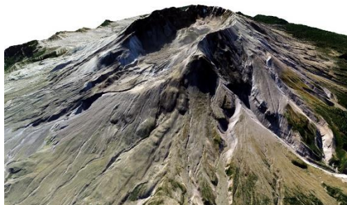
The above image shows a Digital Surface Model (DSM), 3D scene representation of Mount St. Helens.

One of the in-class-demos includes a study of sea level rise in St. Andrews, Scotland. The sequence of scenes, shows the sea level rising by 2, 4, 6, 8.5 and 10 metres. An increase of this magnitude may appear exaggerated at the present time, but the IPCC has predicted that sea level rise will continue for centuries and millennia even if CO 2 emissions stop. During the last interglacial warm spell, the sea level increased by 8.5 metres before the climate changed to an ice age.